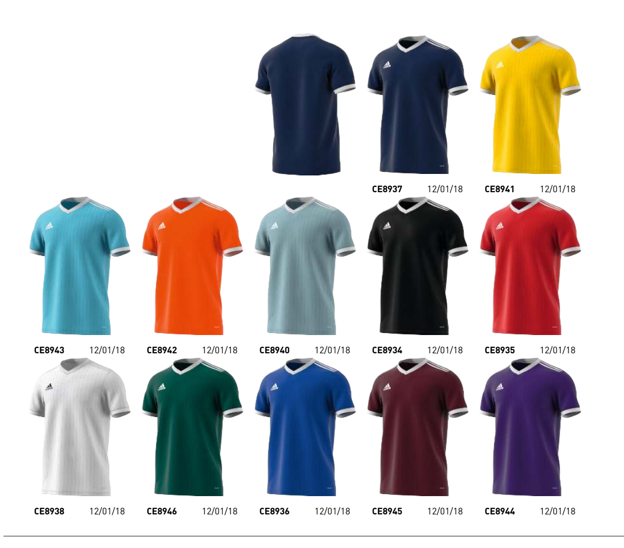
TABELA 18 JERSEY