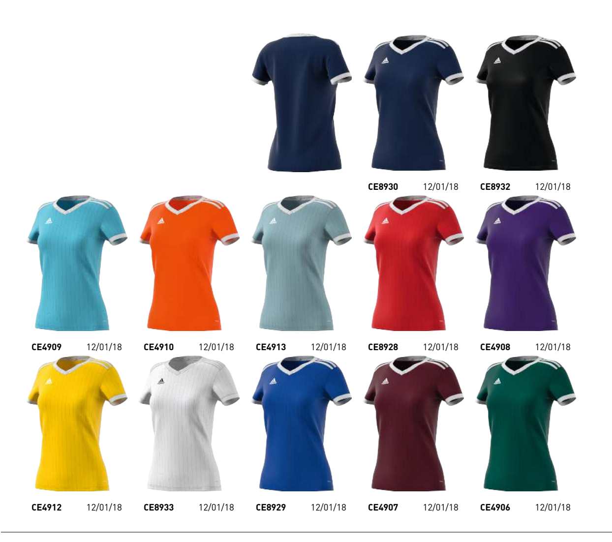
TABELA 18 JERSEY W